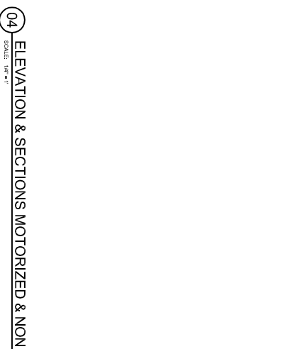
04 ELEVATION & SECTIONS MOTORIZED & NON SCALE: 1/4" = 1'