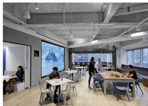
Renlita S-1000 Floataway - open position