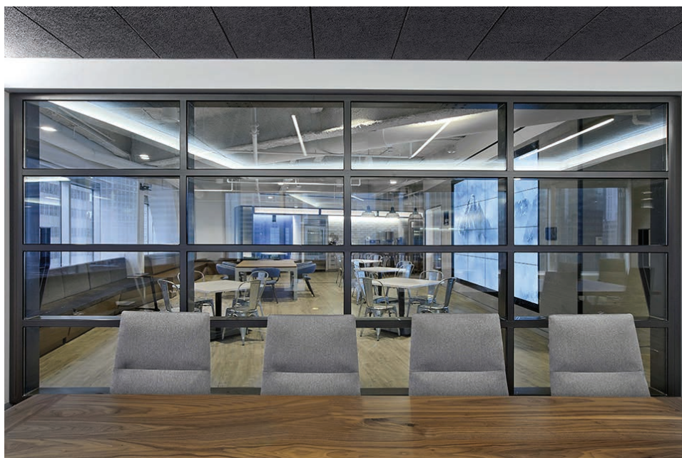
Renlita S-1000 Floataway - closed position