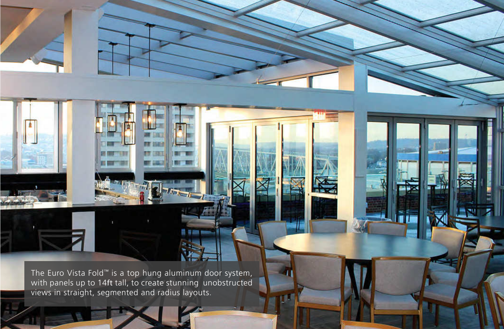
The Euro Vista Fold™ is a top hung aluminum door system, with panels up to 14ft tall, to create stunning unobstructed views in straight, segmented and radius layouts.