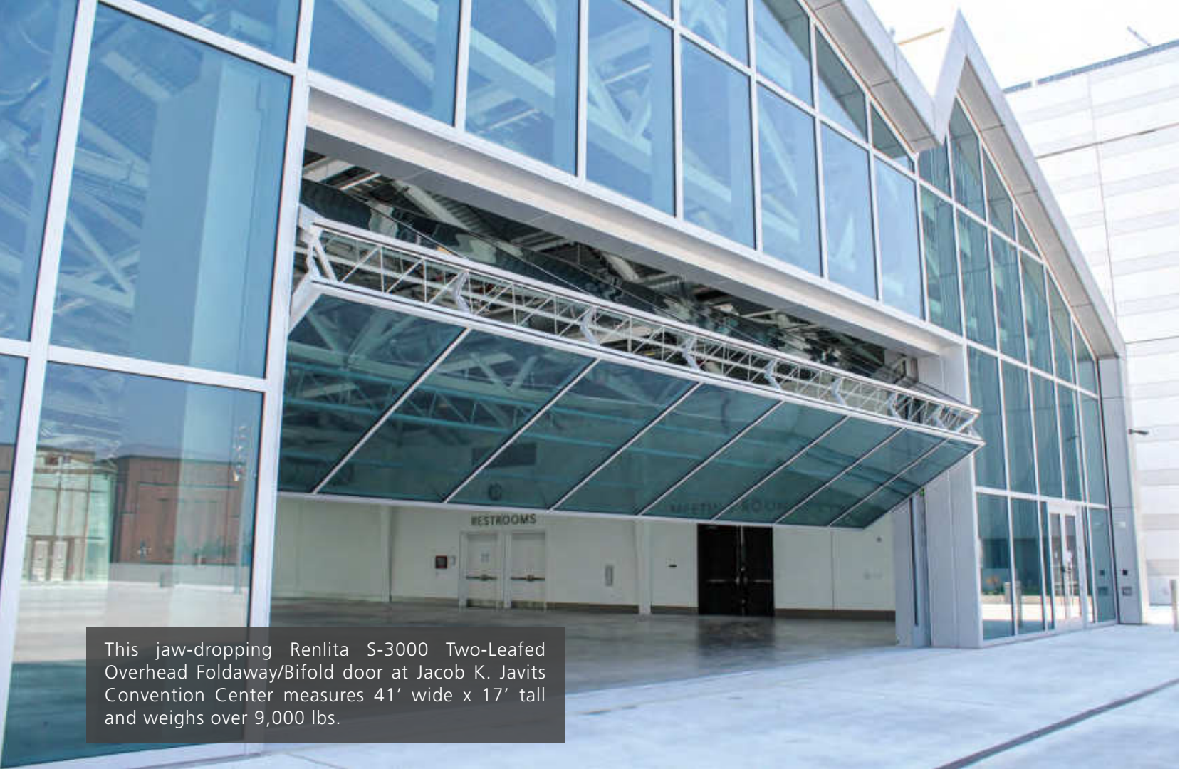
This jaw-dropping Renlita S-3000 Two-Leafed Overhead Foldaway/Bifold door at Jacob K. Javits Convention Center measures 41' wide x 17' tall and weighs over 9,000 lbs.

Create stunning, unobstructed views and connect your space to the outside. Euro-Wall operable glass door systems are designed to withstand hurricanes and are perfect for the unpredictable winters in the northeast. Made in the USA, Euro-Wall specializes in durable door systems that fold, stack, slide and pivot. With the industry's largest widths and heights available, Euro-Wall creates dramatic entrances, exits and dividing doors for interior and exterior spaces.