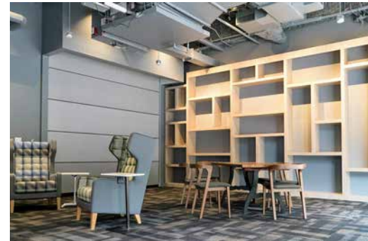
Skyfold Classic 55

The result is a motivating workplace where the atmosphere is flexible and lively, making room for individuals with diverse backgrounds and work styles. In keeping with the spirit of BCG’s mission to, “...bring the right people together” the project’s partnership approach drove BCG’s Summit, NJ office re-design to a winning and stunning transformation.