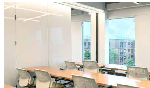
Modernfold Encore Automated Electric Wall