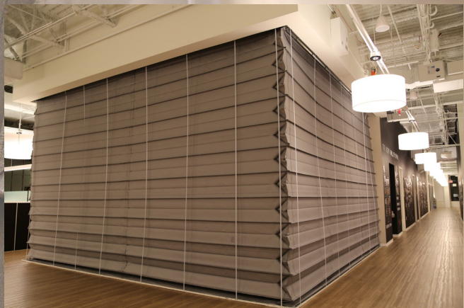
M4000 perimeter curtain • Spanx Corporate Headquarters • Atlanta, GA