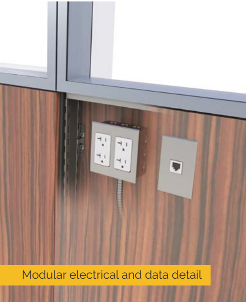
Modular electrical and data detail