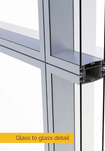
Glass to glass detail